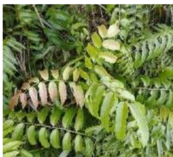
Picture 3 . Kelakai Plants

The results of the study are presented in Table 1 which includes the botanical composition, and the nutritional content contained in the Kelakai leaves, which is supported by Figure 3.